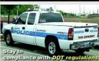
Stay in compliance with DOT regulations!