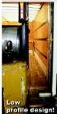
Low profile design!

Load bars and straps are always organized and ready for use!